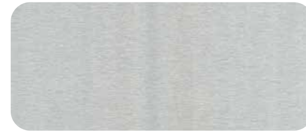
BL001 - Bright Brushed