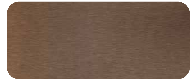
BL006 - Titanium Brushed