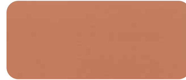
BL003 - Light Copper Brushed