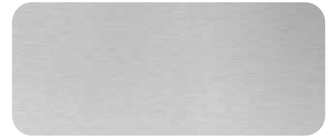
BL002 - Matt Brushed