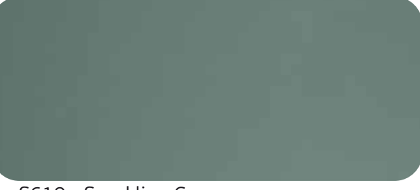
S610 - Sparkling Green