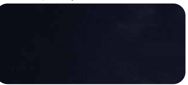
S611 - Sparkling Black Blue