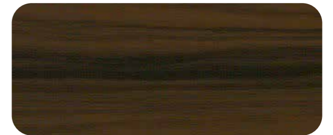
W218 - 1214 - Ebony