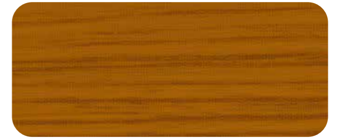
W206 - Golden Oak