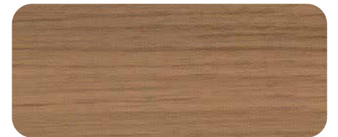
W212 - 1214 - Sunset Teak