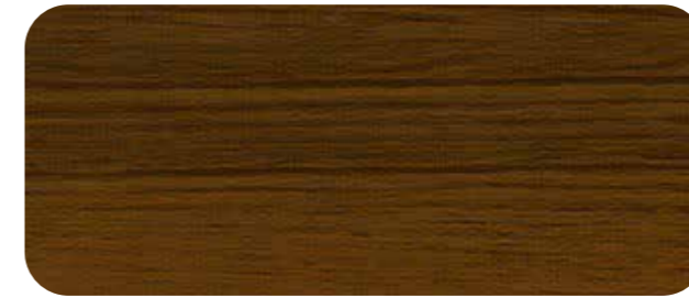
W202 - Teak Light