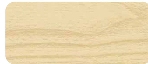
W208 - 1214 - Ahorn