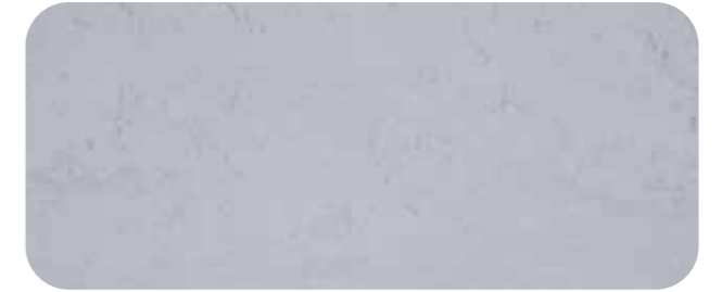
SL009 - Carrara 3