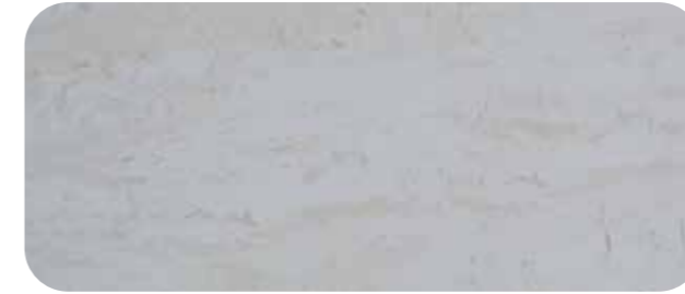
SL008 - Carrara 1