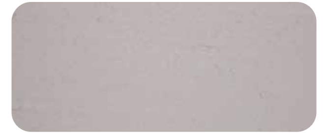
SL007 - Calacatta 1