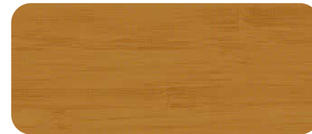
W215 - 1214 - Bamboo Light