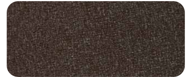
T011 - Pyrite Gold