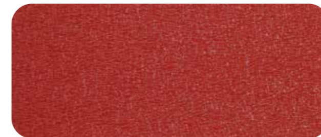
T014 - Wrinkle Terracota