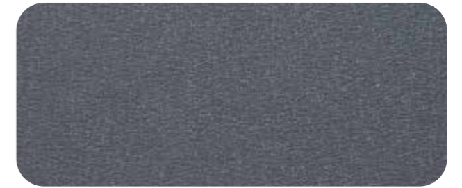
T009 - Slate Grey