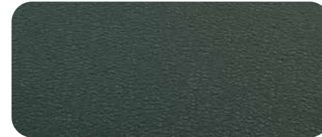
T012 - Fine Green Bottle