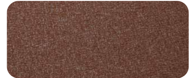
T013 - Wrinkle Bronze